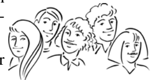
Youth Discovery Weekend

work, another person or even church and Scripture are coequal with Christ. Obviously, family and friends are important, but Jesus is the only Son of God. The church and the Bible, though worthy of devotion, are only vehicles that bring us to Christ.